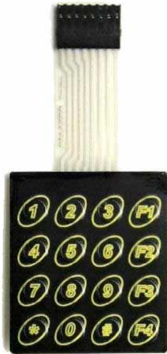
16 KEY, 52x60 mm, matrix