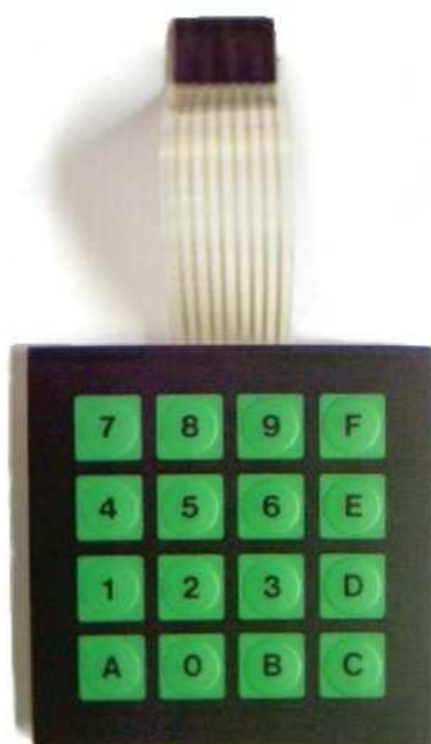
16 KEY, 80x80 mm, matrix